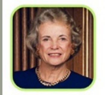
SANDRA DAY O'CONNOR